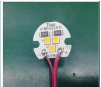
Removal of light source